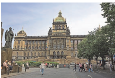
National Museum in Prague

The old mining traditions in what is today the Czech Republic date back to placer gold and tin mining by the Celts ~900 BC and can be traced through the Middle Ages, when the now-classic ore deposits of Kutná Hora (Kuttenberg) and Jáchymov (Joachimsthal) were Europe's main suppliers of silver. These mining activities stimulated the earliest scientific study of various ores and their constituent minerals. Georgius Agricola (1494–1555, "the Father of Mineralogy") was active in Jáchymov during the main period of mining, summarizing his findings in the twelve volumes of his most famous work, De re metallica . Prague's court of Emperor Rudolf II (1552–1612) was a flourishing center of alchemy and science in the early 1600s. Several important mineral collections were founded by Austrian, Czech, and German noblemen over the next 200 years (e.g. I.A. Born 1742–1792, J.N. Mitrowski 1757–1799, K.M. Sternberg 1761–1838), which laid the foundation for the historic collections of the National Museum in Prague and the Moravian Museum in Brno.